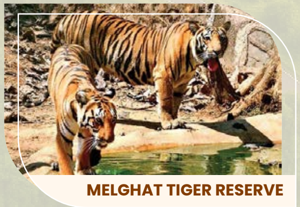
MELGHAT TIGER RESERVE