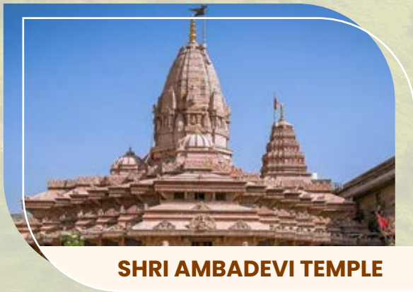
SHRI AMBADEVI TEMPLE