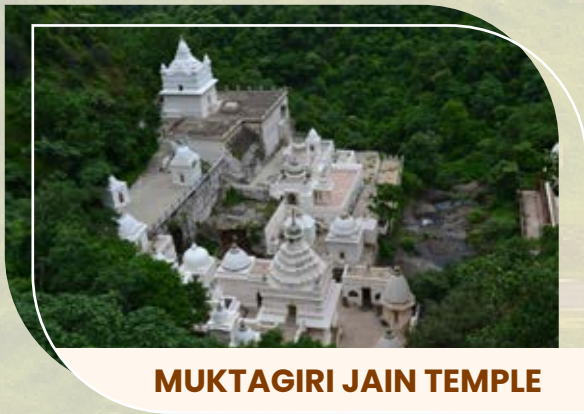
MUKTAGIRI JAIN TEMPLE