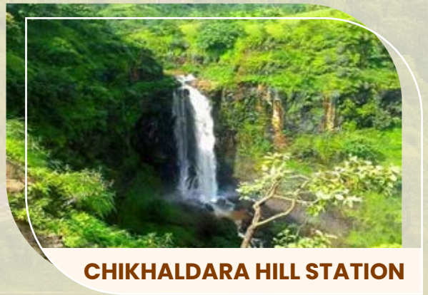
CHIKHALDARA HILL STATION